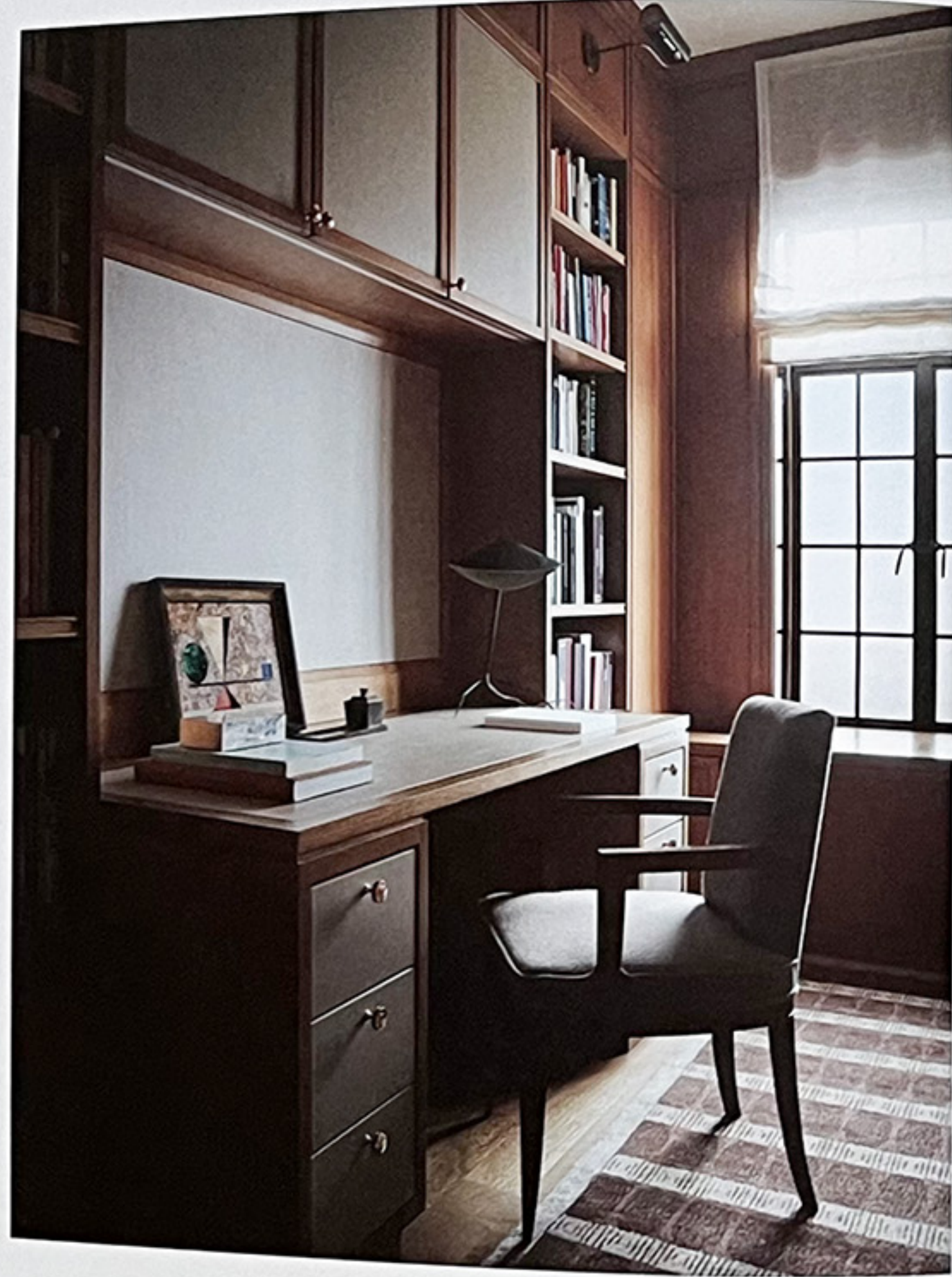
P. 56 A blue vase by Suzanne Ramić, a Harry Bertoia sculpture, and a Georges Joue coupe accessorize the living room. P. 57 A table lamp by Serge Mouille is accompanied by vintage Swedish accessories. LEFT A custom leather-front desk and millwork are paired with a vintage French upholstered chair. RIGHT A Maison Leleu coffee table is the centerpiece of the custom oak library.