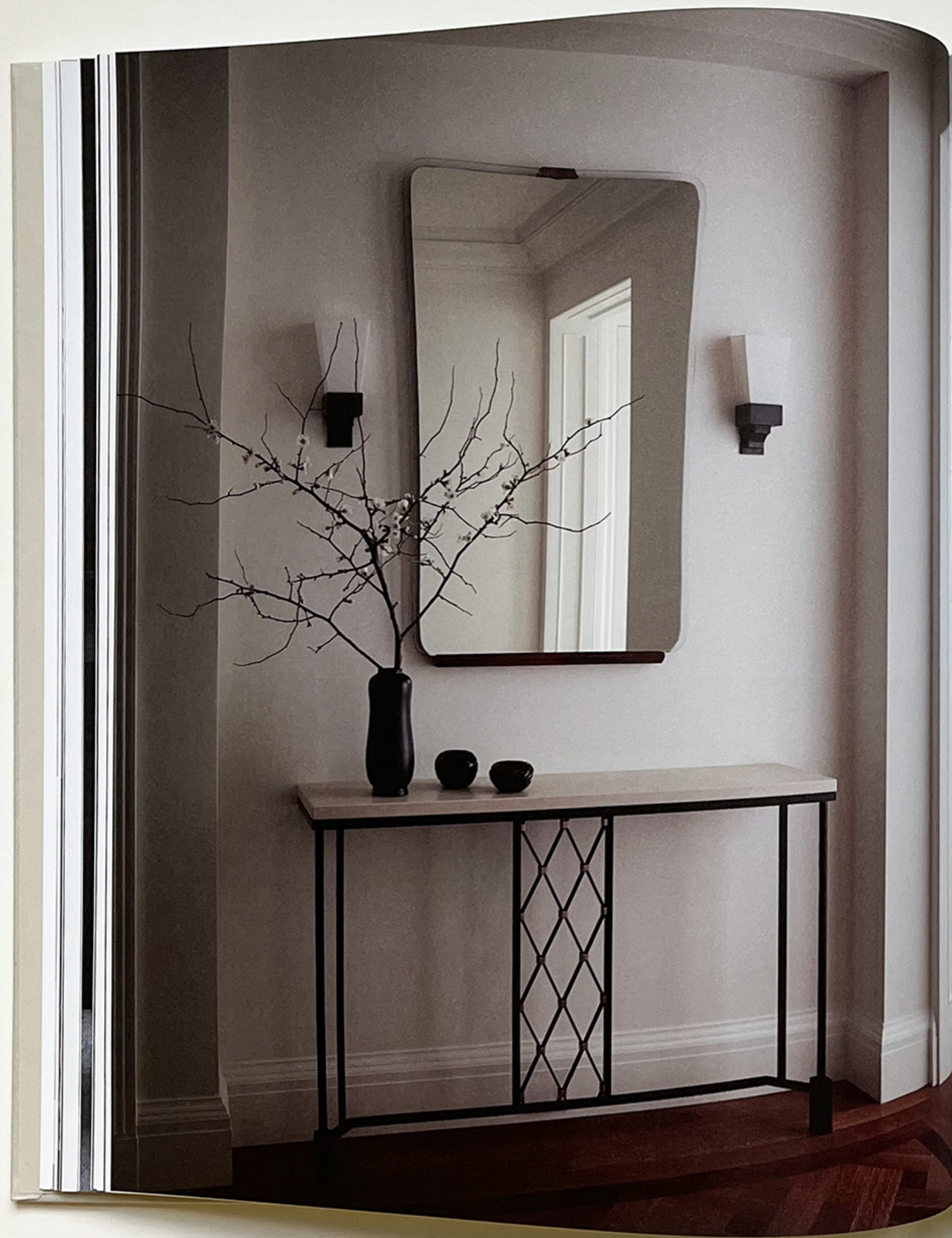
A vintage Italian mirror sits above an iron console.