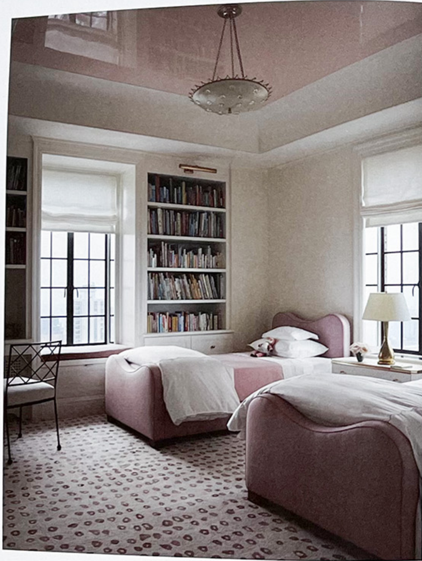
P. 64 The high gloss lacquered wet bar shown with a Fontana Arte light fixture. P. 65 The beautiful primary bathroom has unobstructed views of Central Park. LEFT The daughters' picturesque bedroom with a vintage light fixture and custom upholstered beds. RIGHT A custom mahogany bed designed by Alyssa Kapito Interiors paired with Danish armchairs.